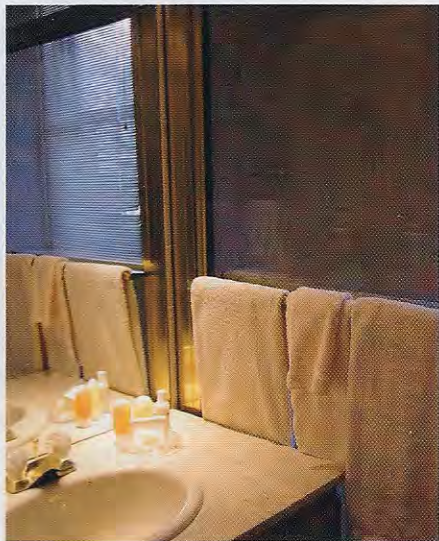
BEFORE & AFTER: Recent interior remodel by Robyn Scott Interiors shows transformation of bathroom (above) and residence entry (below).